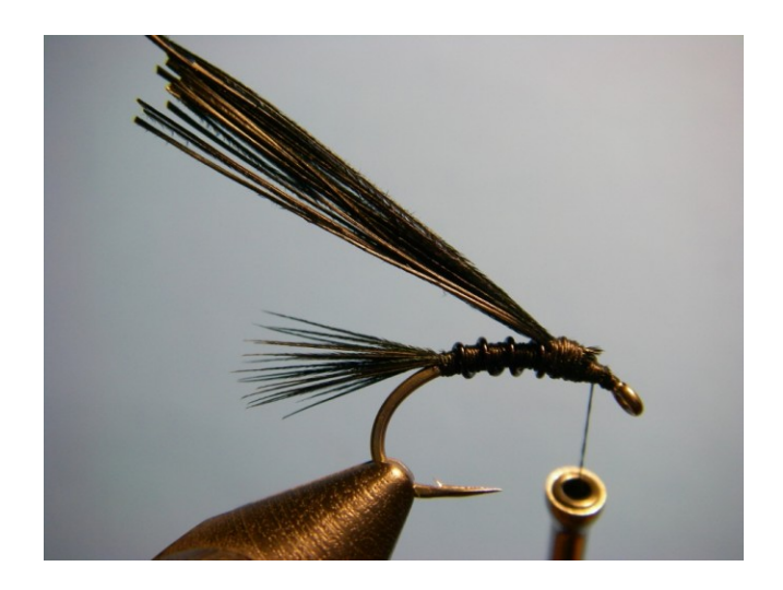
Step 4. Tie in another clump of pheasant tail (or the remainder of the original material) to serve as the wingcase.