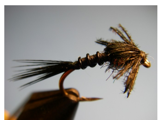
Step 8. Trim the fibers, which are now the legs, so they are slightly longer than the thorax. Whip Finish and apply water based head cement over the thread body and head. Standard head cements will melt Ice Dub.