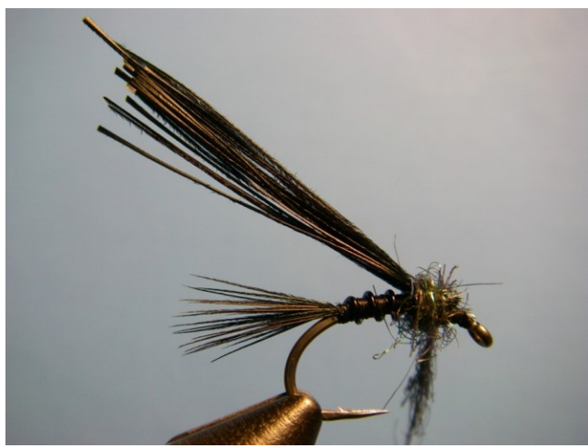
Step 5. Dub a robust thorax with Ice Dub.