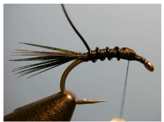
Step 3. Tie in the wire on top of the hook at the thorax area. With your fingernail against the wire to keep the wire from spinning at the tie-in area, wind the wire back towards the tail. Using wire cutters, trim the wire.

Step 2. Select 8-10 strands of pheasant tail dyed black and tie in on top of the hook so the natural tips of the tail extend about a hook gape's distance beyond the barb/base layer. Now wrap thread back towards hook eye and over the shank which becomes the body.