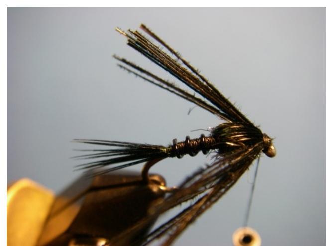
Step 7. Divide the pheasant tail fibers to each side of the hook and wrap them so they are positioned about 45 degrees angled backwards.