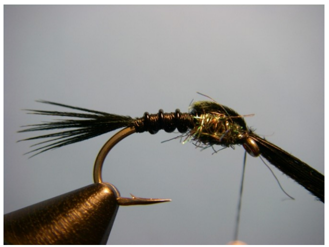
Step 6. Pull the pheasant tail fibers over the thorax as the wingcase and tie down with two or three wraps – DO NOT TRIM excess material.