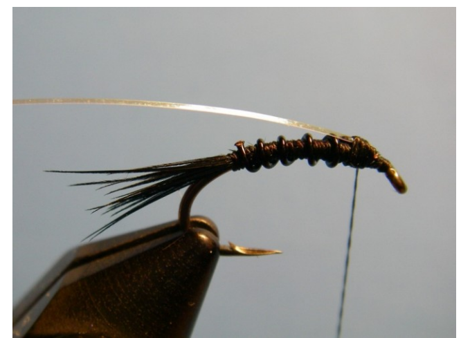
Step – 3 1/2. Between Steps 3 and 4, tie in a piece of flashabou.