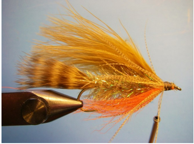
Step 8. Wrap a collar of the mallard flank feather.