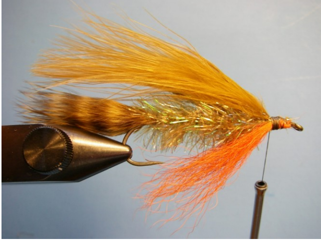
Step 6. Tie in a clump of Kip/Calf Tail on the underside so the tips extend to approximately the hook barb.