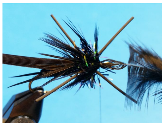
Step 12. Gently pull the saddle feather over the top of the thorax and tie down.