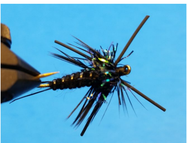
Final: Sparkle Stonefly Nymph