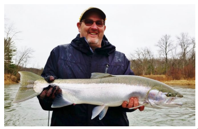
Steelhead caught on Sparkle Stonefly Nymph

The clarity of the water typically becomes stained with increased flows due to winter's thaw and rains which is why this large profile fly pattern and sparkle thorax help attract the fish's attention. The color black remains visible in the water column as it contrasts the stained water while the rest of the pattern does a good job of providing a stoneflies silhouette. And the rubber legs just add a little motion while it dead drifts.