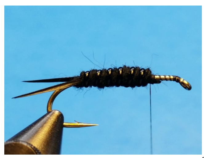
Step 6. Wind rib, convex (rounded) side up, through body creating a segmented look.