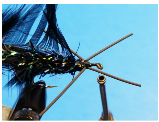
Step 10. Tie in a rubber leg on each side of the thorax.