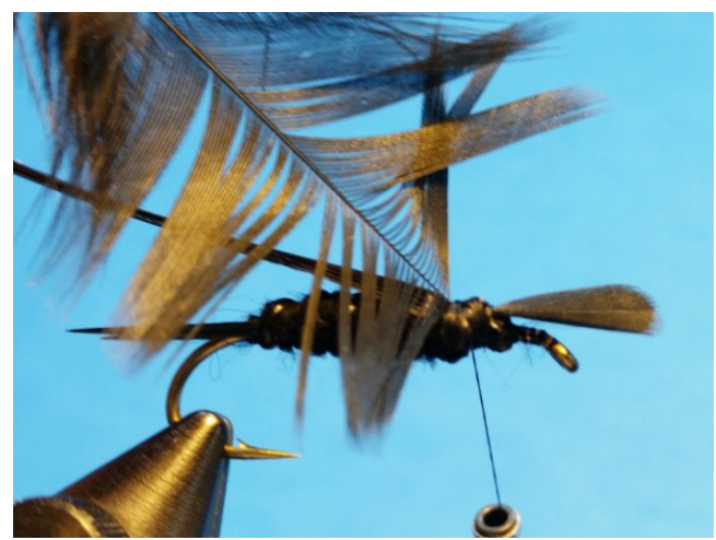
Step 8. Tie in the tip of a hen saddle feather convex side facing rear of the hook.