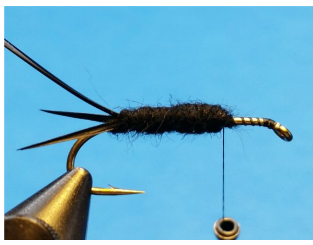
Step 5. Dub a tapered body from the tail 2/3rds of the way up hook shank.