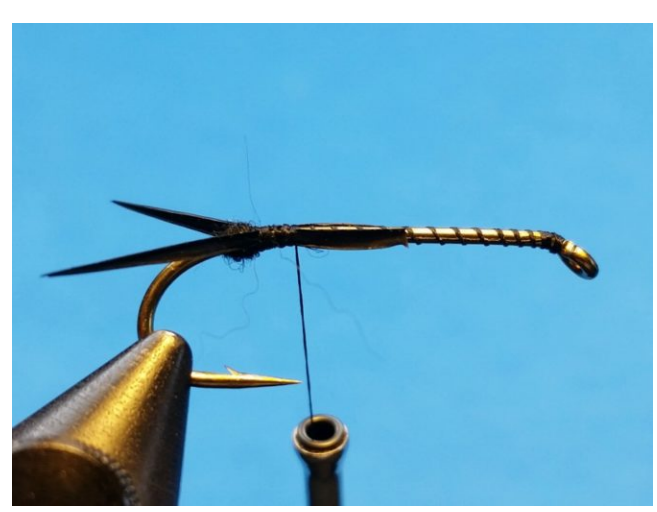
Step 3. Tie in biots – with the natural curve opposing each other in opposite directions.

Use the dubbing ball to help spread them. The pointed ends should extend the distance of the hook gape.