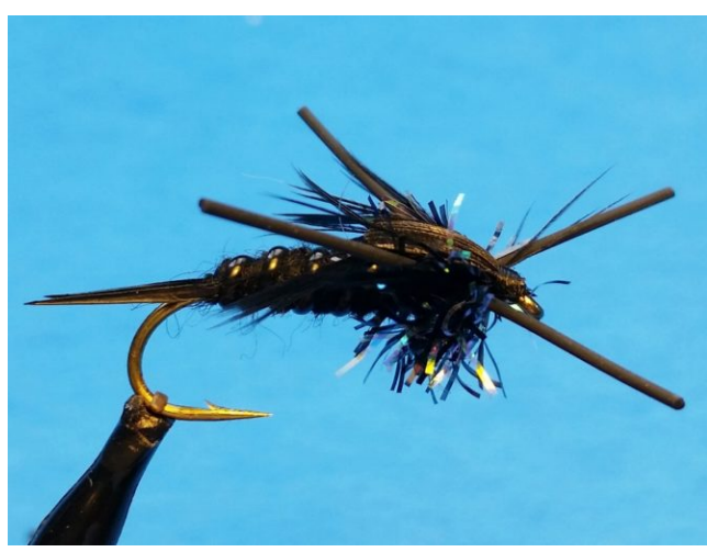
Sparkle Stonefly Nymph

Large stonefly nymphs populate most of our trout and steelhead rivers and because of their size, they offer a calorie packed snack to fish. Water levels often fluctuate dramatically in the Spring as snow melts and this increase in water flow often dislodges these large nymphs and send them tumbling downstream making this pattern ideal for Spring Steelhead.