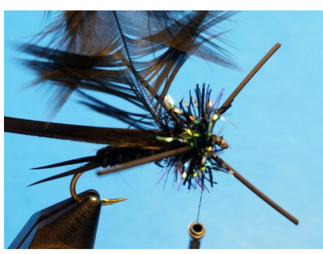
Step 11. Wind thorax material toward the eye so rubber legs are separated – maintaining an X profile.