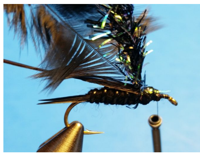
Step 9. Tie in Estaz or Chenille just in front of where saddle hackle is tied in.