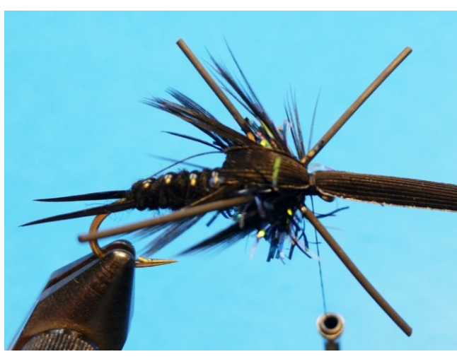
Step 13. Pull wing case over thorax, trim and whip finish.