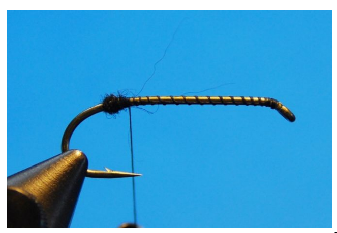
Step 2. Tie in a very small ball of dubbing above the barb to help spread the tail.