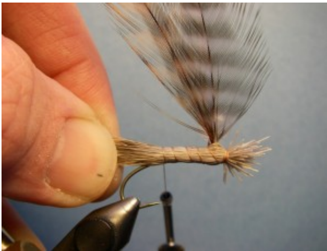
Step 7. Gently wrap the thread backwards while holding the extended deer hair with your opposite hand. Make for even spaced wraps falling 1/4" from the tips.