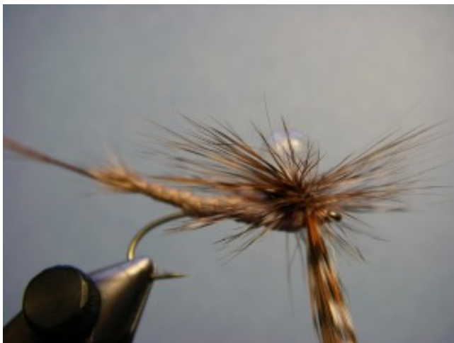
Step 10. Take both the feathers at the same time and wrap them under the bulbous uni-bobber and make a heavy parachute style hackle. Tie off and whip finish. Be sure to out head cement on both the head of the fly and the wraps at the end of the extended body.