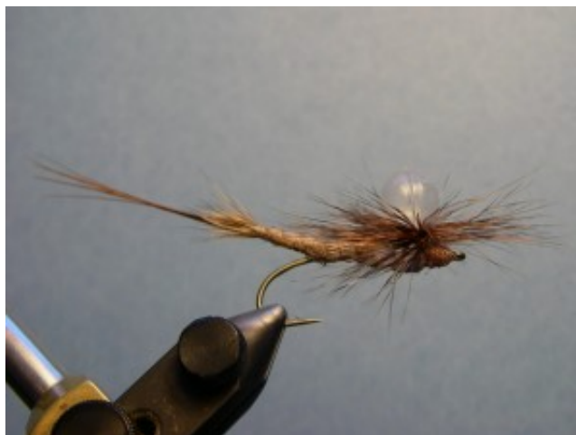
The end result!