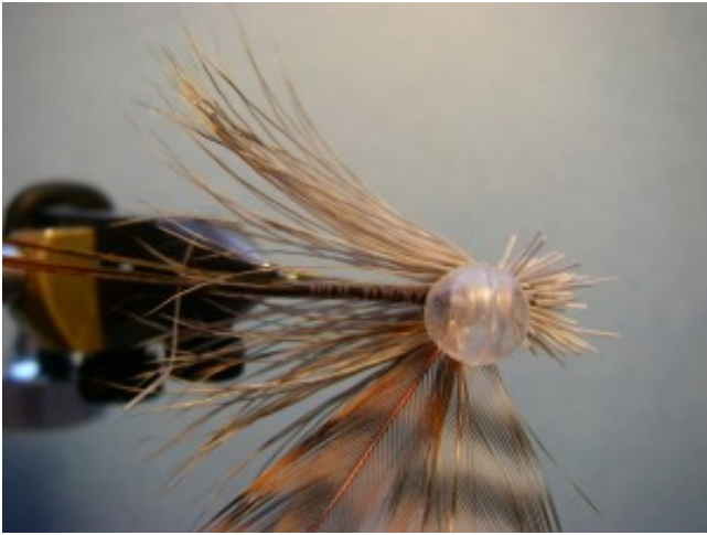
Step 6. Even the hair so it is on both sides of the hook shank.

body which should be aprox. 2/3 of a pencil's diameter. Tie in the deer hair between the uni-bobber and hook eye so the tips extends beyond the hook half the length of the shank. The pheasant tail fibers should extend beyond the tips making for a tail.