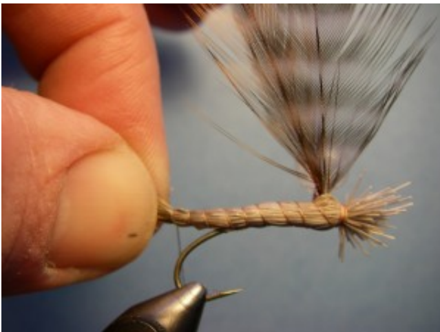
Step 8. At the end, make two or three wraps a little