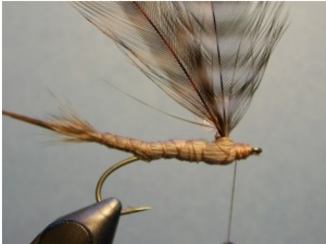
Step 9. Trim the butts of the deer hair and tie down the head covering any deer hair that is exposed.

more pressure, then advance the thread forward again with increased pressure, crisscrossing the wraps and ending between the uni-bobber and hook eye.